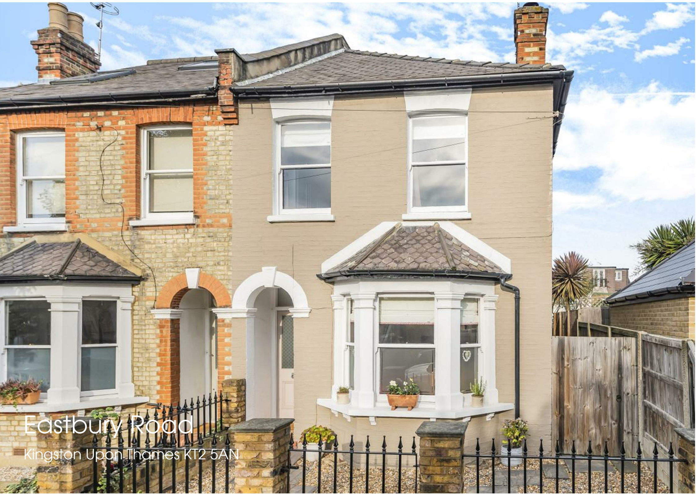
Eastbury Road Kingston Upon Thames KT2 5AN

34 Richmond Road Kingston upon Thames Surrey KT2 5ED www.gibsonlane.co.uk Tel: 020 8546 5444